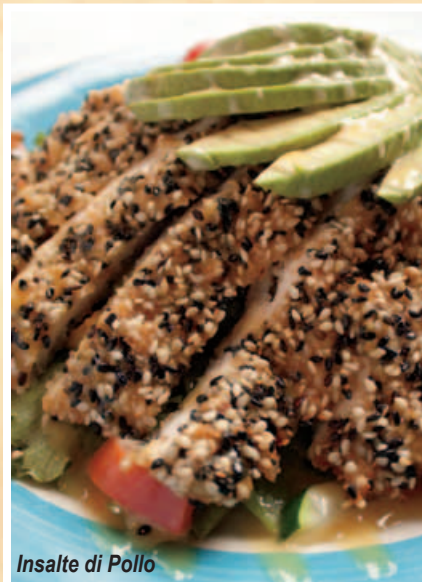
Insalate di Pollo