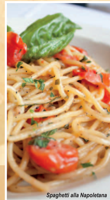
Spaghetti alla Napoletana